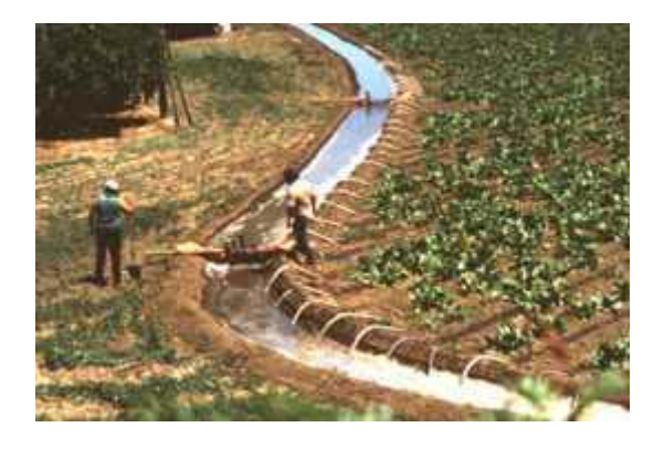
Figure 5. Gravity Irrigation (San Joaquin Geological Society)

Gravity irrigation is another major type of water delivery. This system also uses a main water source but uses gravity rather then a pump to move the water. Furrows or canals, similar to the one seen below, are often used as a way of delivering water to the fields, but farmers can use different types of piping as an alternative. This system is labor intensive because the furrows and canals need to be built and maintained, but is inexpensive due to the lack of pumping equipment. An added consideration with gravity irrigation, however, is the topography of the land due, to its reliance on gravity. This system works best on level or moderate slopes (Finkel 349).