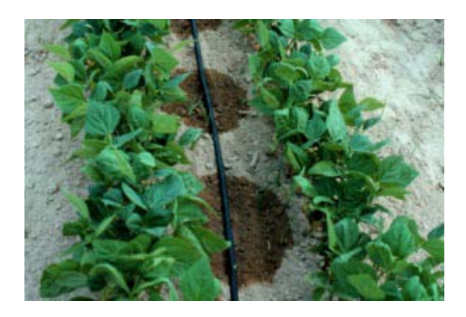
Figure 4. Drip Irrigation System (USDA)