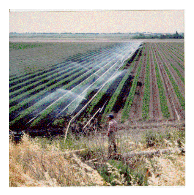
Figure 3. Sprinkler Irrigation System

pipes to the actual sprinklers, which spray the irrigated water over the desired area. As pumps are often expensive, there is significant cost associated with the equipment used in this type of operation. Construction of this system is fairly simple, however (Finkel 193).